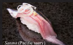
Sanma (Pacific saury)