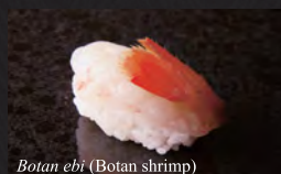
Botan ebi (Botan shrimp)