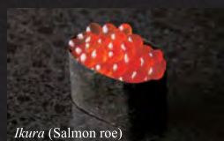
Ikura (Salmon roe)