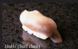
Hokki (Surf clam)

Please use the pictures for okonomi ordering by pointing to the ones you would like.