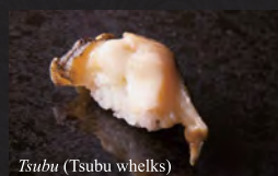
Tsubu (Tsubu whelks)