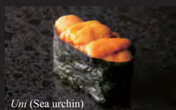
Uni (Sea urchin)