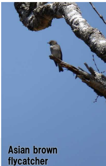
Asian brown flycatcher