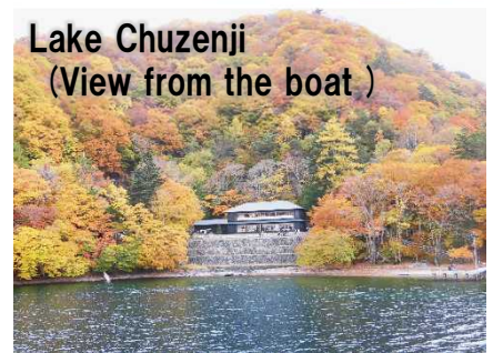
Lake Chuzenji (View from the boat)