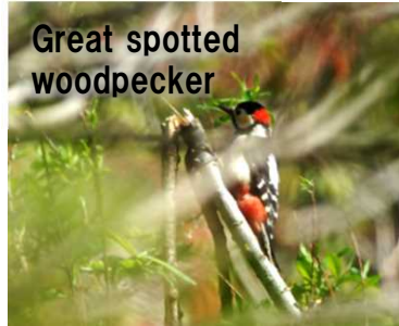
Great spotted woodpecker