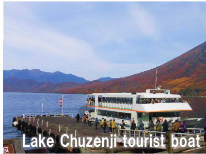
Lake Chuzenji tourist boat