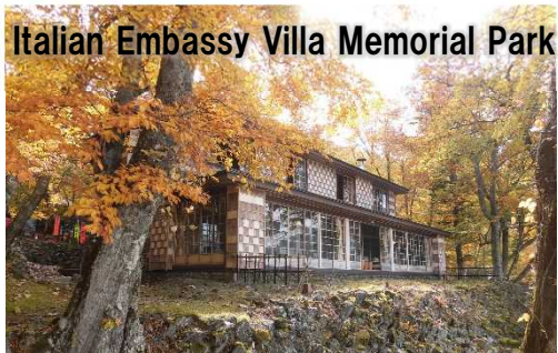
Italian Embassy Villa Memorial Park

You can enjoy the beauty of Lake Chuzenji seen from the check pattern made of bark and thin sheets of Nikko cedar and villa memorial park.