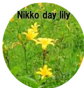
Nikko day lily