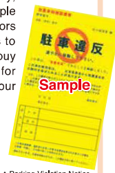
▲ Parking Violation Notice